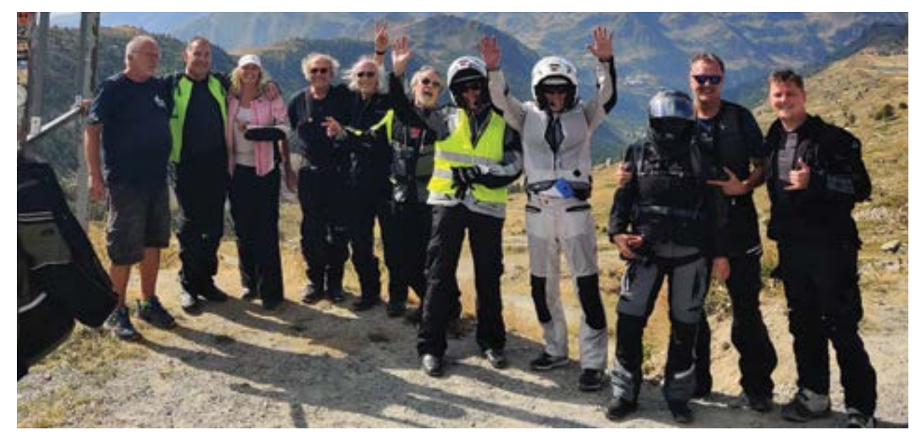
This is the part where I say "we all became the best of friends and are exchanging Christmas cards." Not really, but it is kind of amazing how different people from "all walks of life" (ok, that's not really true either) or at least a few geezers with a little disposable income and not much else in common, except motorcycles, really can become a tight-knit little band of brothers (and two sisters) in just a few days riding together. Cheers, mes amis!

knives for the kids, and ducked into the local bar, Le Soft, on the way back to the hotel to observe the natives. I'm sure the French have their problems, too, but they don't wear them so close to the surface. An older gentleman is having a glass of wine at a table; his wife collects him on her way home with a baguette poking out of her grocery bag. Au revoir, monsieur, and bon appetit.