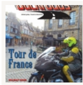
Shira Kamil, USA / Backroads