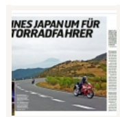
Töff Magazine Suisse